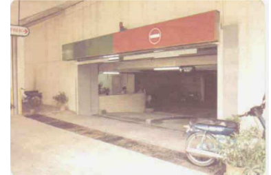
Floodgate Fully Open: (7'6" x 20'0")